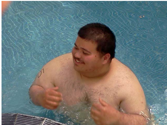
Photos taken last week at the AWD Swim Meet at Stokes Valley Pool