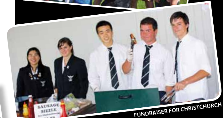
FUNDRAISER FOR CHRISTCHURCH