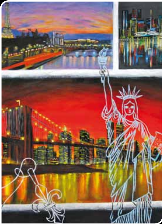
ART BY MADHURI SHENOY

Applications received from out-of-zone students after the closure date will be held on a waiting list and places may be offered as a result of a further ballot.