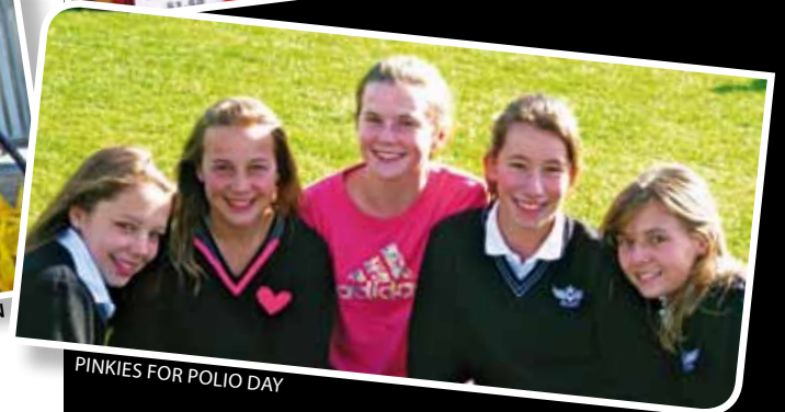
PINKIES FOR POLIO DAY