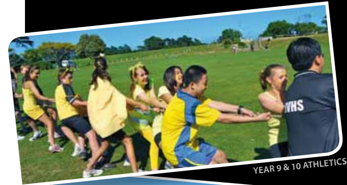
YEAR 9 & 10 ATHLETICS

There are many interest groups and clubs run by students for students, such as the Environment Group, Chess, Debating and Release Christian group.