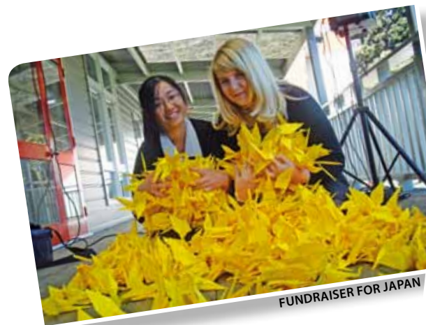
FUNDRAISER FOR JAPAN